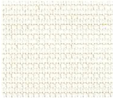
Cream (non fr)